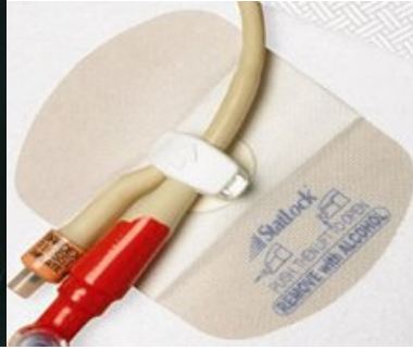
Stat-Lock holds catheter